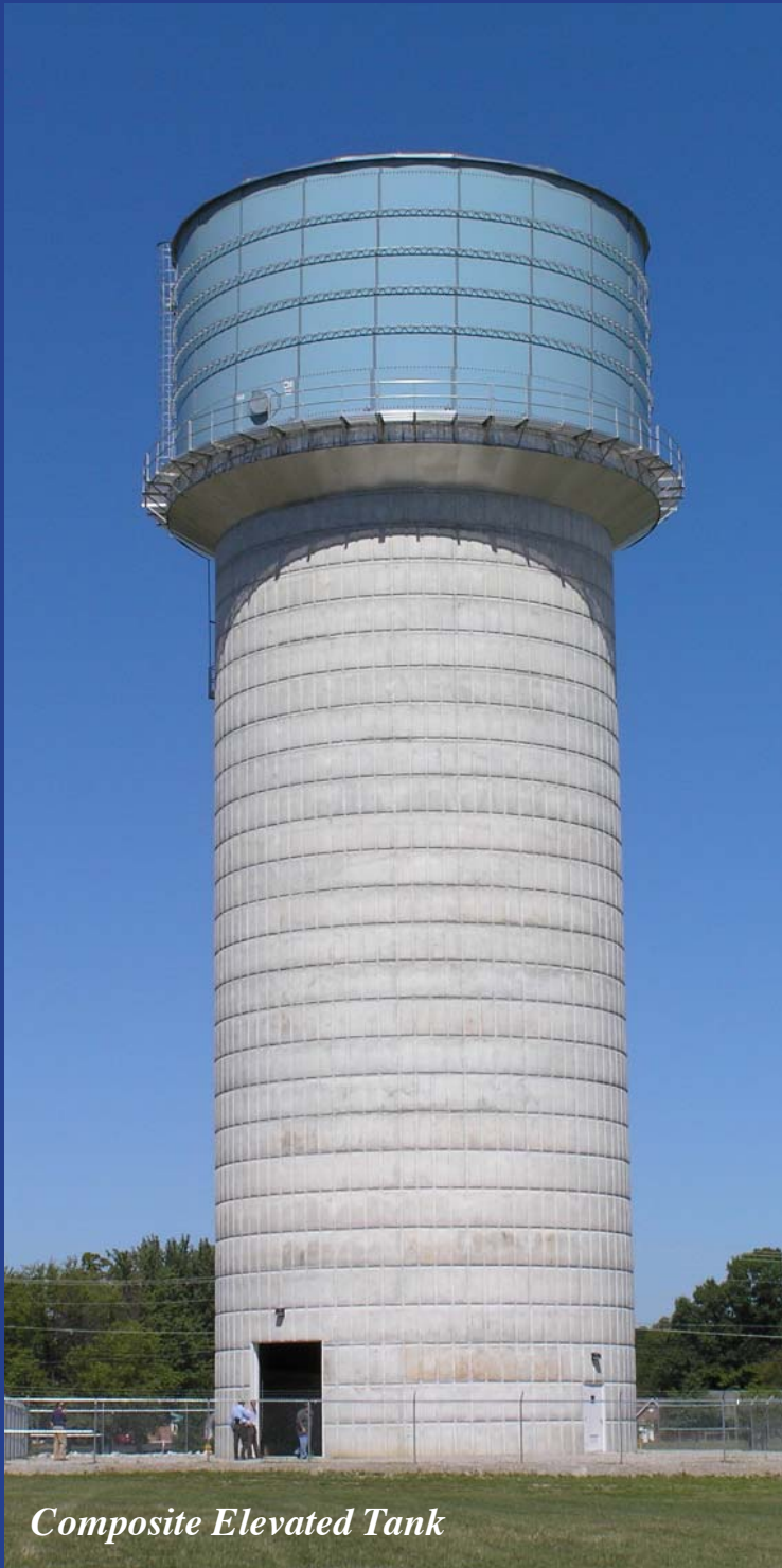
Composite Elevated Tank